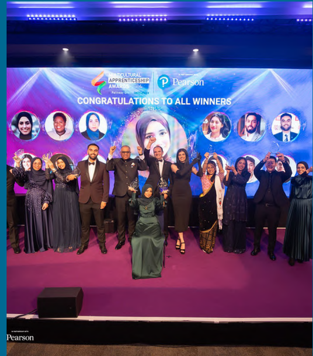
Founded by Pathway Group and organised by ThinkFest, the Multicultural Apprenticeship Awards showcase the talent and diversity within multicultural communities through the celebration of those working to overcome adversity to achieve their goals through apprenticeships.